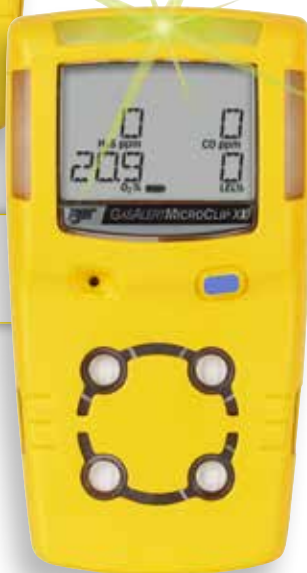
GasAlert MicroClip XL

NEW! GasAlertMicroClip X3 and GasAlertMicroClip XL now feature IP68 for maximum water and dust protection — up to 45 minutes at a depth of 1.2 m.