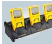
Five unit cradle charger

For a complete list of kits and accessories, please contact BW Technologies by Honeywell.