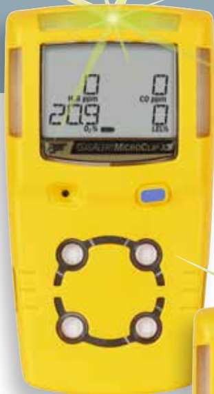
GasAlert MicroClip X3

Guaranteed to run for an entire shift — even in harsh weather.