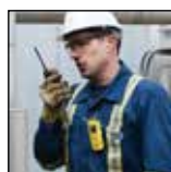
Easy To Wear