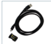
IR connectivity kit