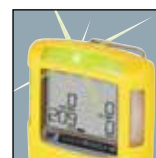
Easy to See